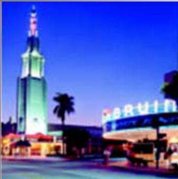
Mann Village and Bruin Theatre